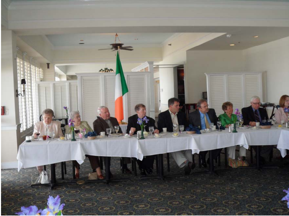
Figure 4 Attendees at the luncheon